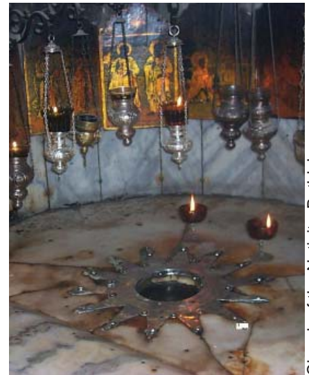
Church of the Nativity, Bethlehem