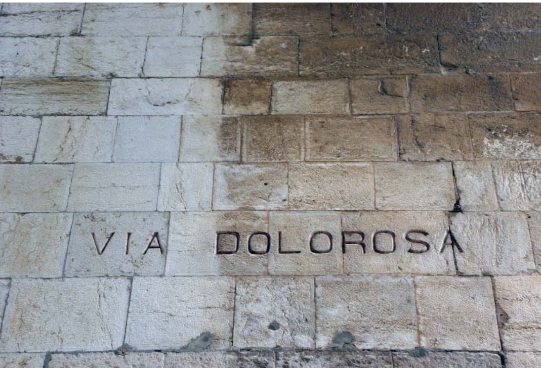
Way of the Cross