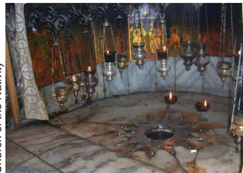
Church of the Nativity