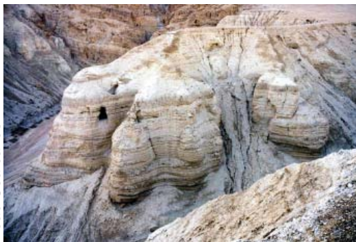
Dead Sea caves